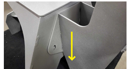
Figure 2: Slide hooks into bottom piece and push down to secure.