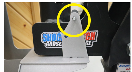
Figure 5: For offset models, use the top pin hole.