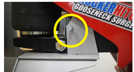
Figure 4: For standard models, use the bottom pin hole.