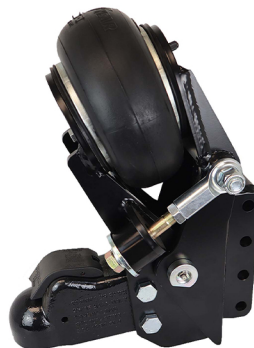
CAST 2-5/16" HD DEMCO COUPLER