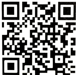
HOW TO SET AIR PRESSURE