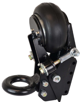
PINTLE RING SIZE - 6" OD x 3" ID