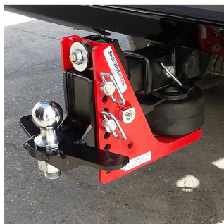
SWAY DROP BALL: 0" RISE TO 7.5" DROP 2-5/16" BALL - 20,000 LBS/2" BALL - 10,000 LBS