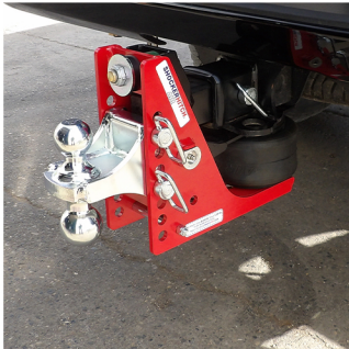
COMBO BALL: 4" RISE TO 4" DROP 2-5/16" BALL - 20,000 LBS & 2" BALL - 10,000 LBS