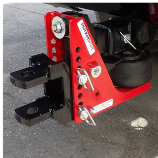
CLEVIS MOUNT: 1.5" RISE TO 5.5" DROP 20,000 LBS