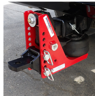
DRAWBAR MOUNT: 3.5" RISE TO 3.5" DROP 20,000 LBS