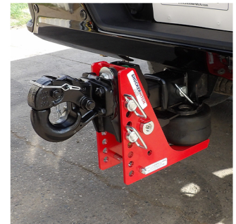
PINTLE HOOK: 4" RISE TO 6.5" DROP 10 TONS (20,000 LBS)