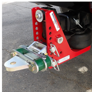
CUSHIONED DRAWBAR: 3.5" RISE TO 3.5" DROP 20,000 LBS