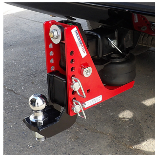
DROP BALL: 0" RISE TO 7.5" DROP 2-5/16" BALL - 20,000 LBS/2" BALL - 10,000 LBS