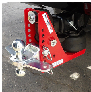
SWAY COMBO BALL: 4" RISE TO 4" DROP 2-5/16" BALL - 20,000 LBS & 2" BALL - 10,000 LBS