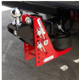
RAISED BALL: 5" RISE TO 3" DROP 2-5/16" BALL - 20,000 LBS/2" BALL - 10,000 LBS